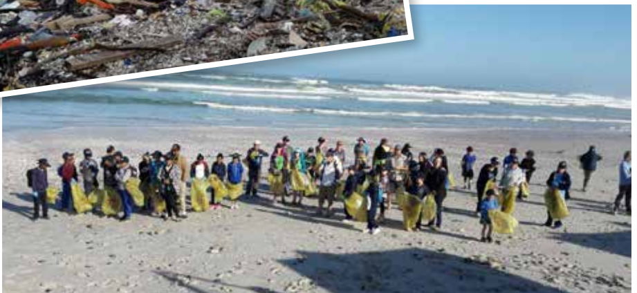
Below: The Beach cleanup group in action on the 9th Sept 2017