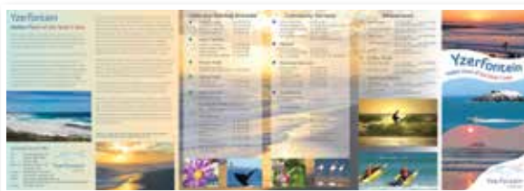
Last years brochure

Now is the time! If you want your establishment, accommodation or business to be listed in this new and exciting brochure, as well as on the new Yzerfontein map that's included in the brochure, please contact Lin at the Yzerfontein Tourism office to register before the cutoff date of 20 July 2018 .