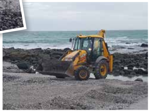
Onder: Op die dag