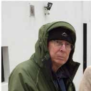
Top Left: Adult Hyena teeth