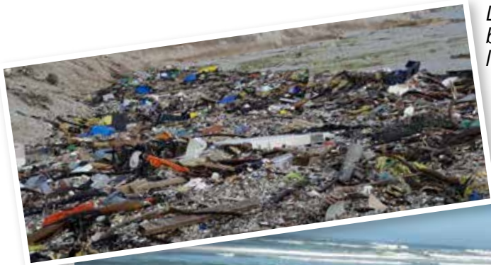
Left: Pollution on the beach after the storms last year

Yzerfontein Tourism will arrange another beach cleanup in October 2018 after the winter stormy season. Specific dates will be announced soon.